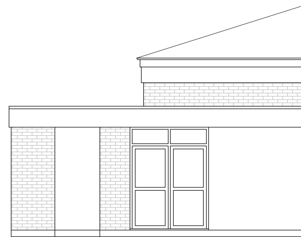
existing north front elevation scale 1:50